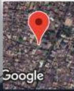
Kolkata, West Bengal, India Bechu Chatterjee Street, H9J9+2PC, College Street, Kolkata, West Bengal 700009, India Lat 22.580043° Long 88.369477° 09/12/22 12:48 PM GMT +05:30