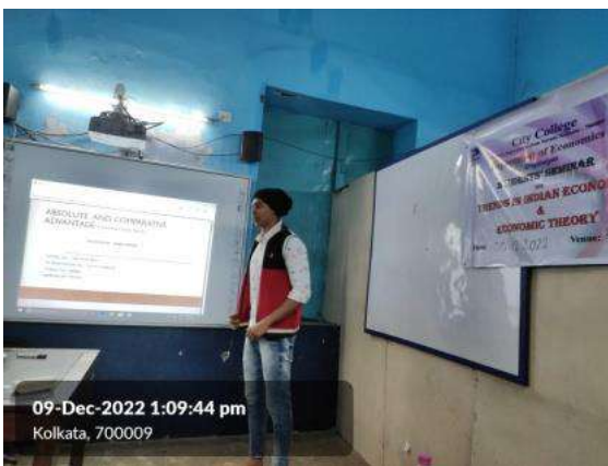
09-Dec-2022 1:09:44 pm Kolkata, 700009