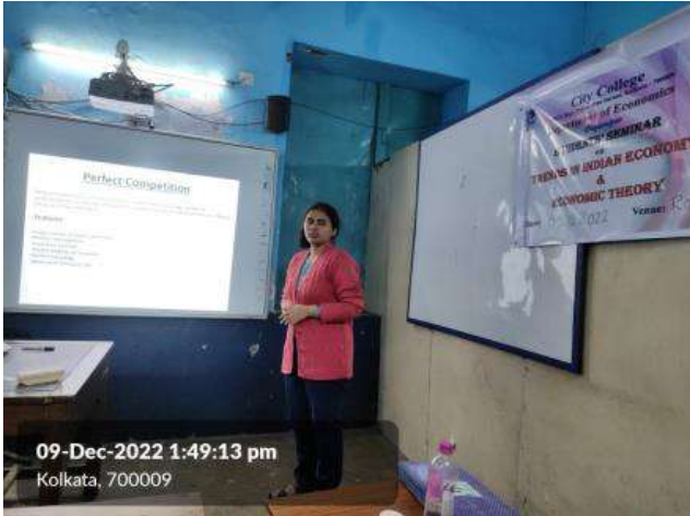
09-Dec-2022 1:49:13 pm Kolkata, 700009